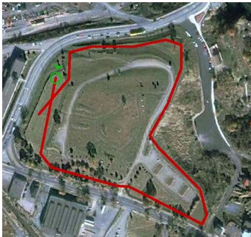
1.1 km Loop